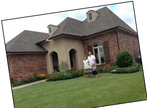
July 206 Copper Ridge

Each month, we ask homeowners to nominate yards whose owners have gone above and beyond to make their yards aesthetically pleasing for surrounding neighbors. Below are a few of our recent Yard of the Month winners. Nominations may be sent at any time during the month to yardofthemonth@coppermeadowsonline.com We look forward to hearing from you.