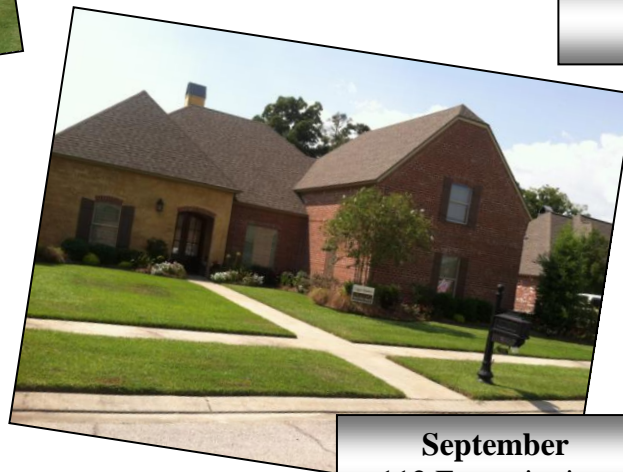
September 112 Fountainview