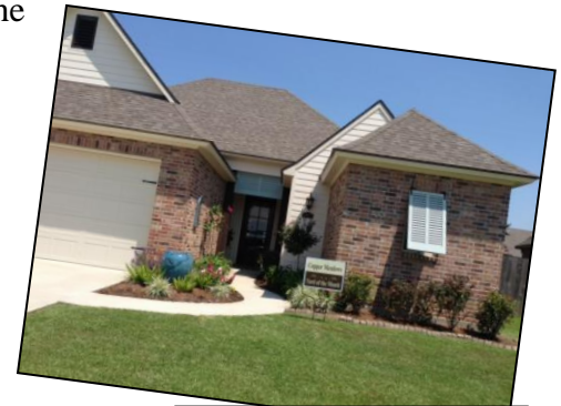
August 102 Brookfield